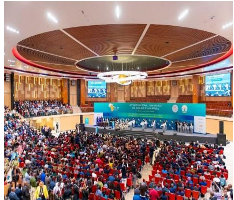
ICASA 2019 OPENING CEREMONY

Please see following pages for details on each item.