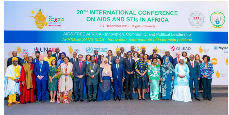
GROUP PICTURE ICASA 2019 OPENING CEREMONY

Bank: ECOBANK GHANA LIMITED Branch: A&C SHOPPING MALL, EAST LEGON Physical Address: PMBGPO ACCRA – GHANA Account name: SOCIETY FOR AIDS IN AFRICA – ICASA 2021 PARTNERSHIP/SATELITE/EXHIBITION Account number: 2441000304906 Ecobank’s Swift Code: ECOCGHAC Ecobank’s Correspondent Bank: DZ BANK, FRANKFURT GERMANY Swift Code for Correspondent Bank: GENODEFF Account Currency: US Dollars Reference: Purpose of transfer should be indicated on reference field. Bank code: 13-01-00 Branch code: 13-01-07 NB: (i) All local and overseas charges must be borne by the Sender. (ii) Kindly always send us proof of transfer or swift advice for our notification/follow-up and record. Thank you.