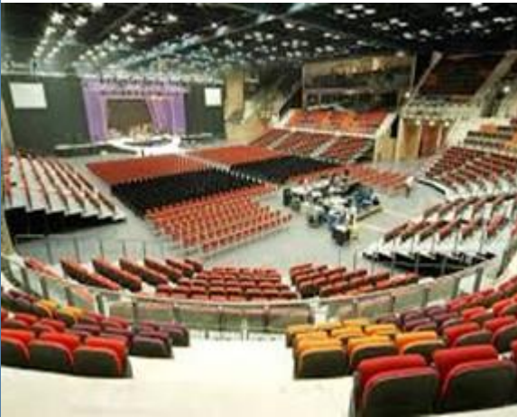
Durban ICC Hall