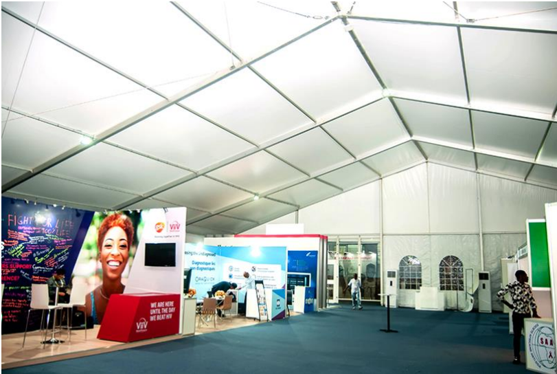
ICASA 2019 In-person Exhibition Hall