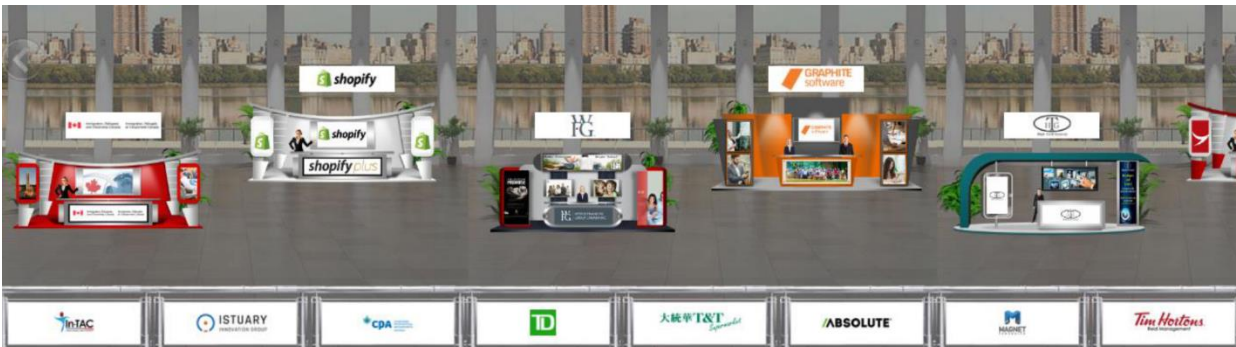
Virtual Exhibition Hall