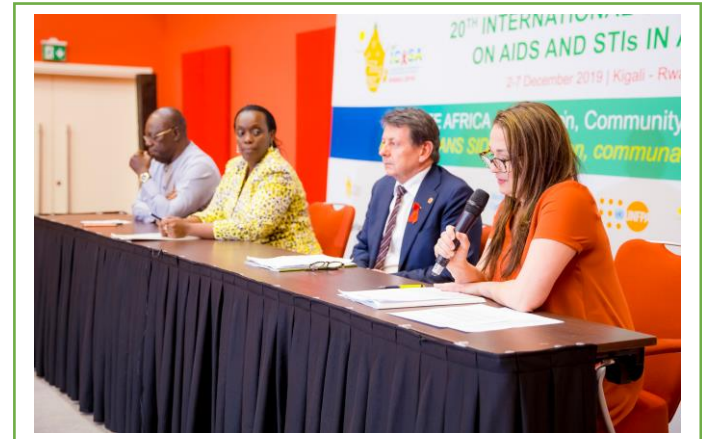
PRESS CONFERENCE AT ICASA 2019

Book your Hybrid Exhibition Space now – DEADLINE: 31st AUG 2021