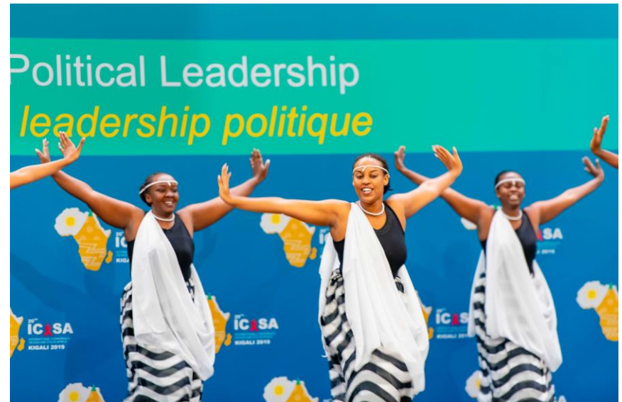
ENTERTAINMENT DURING ICASA 2019 OPENING CEREMONY