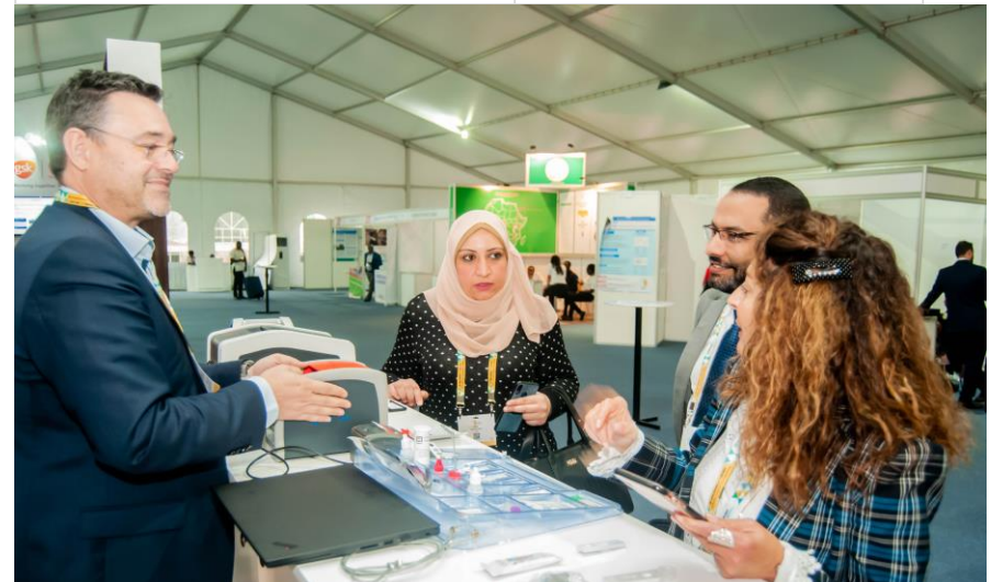
Exhibition at ICASA Rwanda